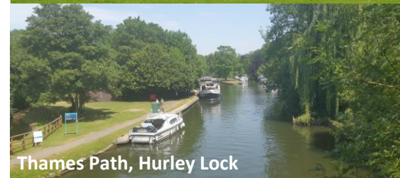
Thames Path, Hurley Lock