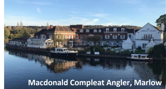
Macdonald Compleat Angler, Marlow