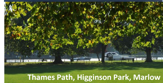
Thames Path, Higginson Park, Marlow