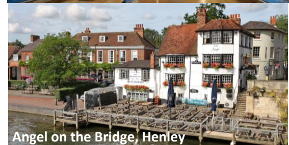
Angel on the Bridge, Henley