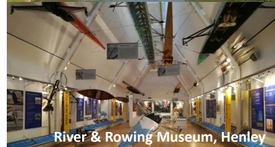
River & Rowing Museum, Henley